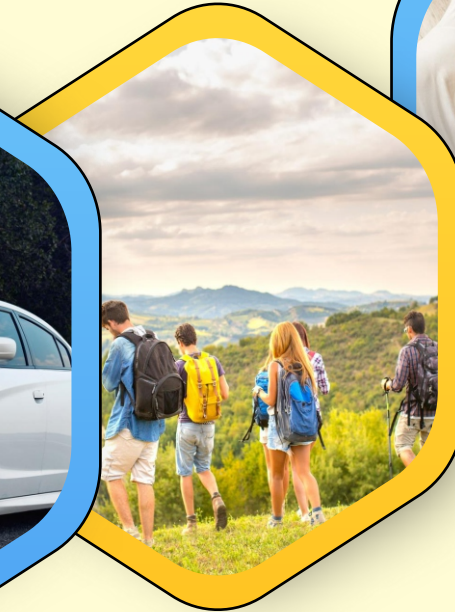
Freedom Of Time