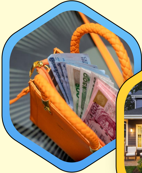
Lots Of Money